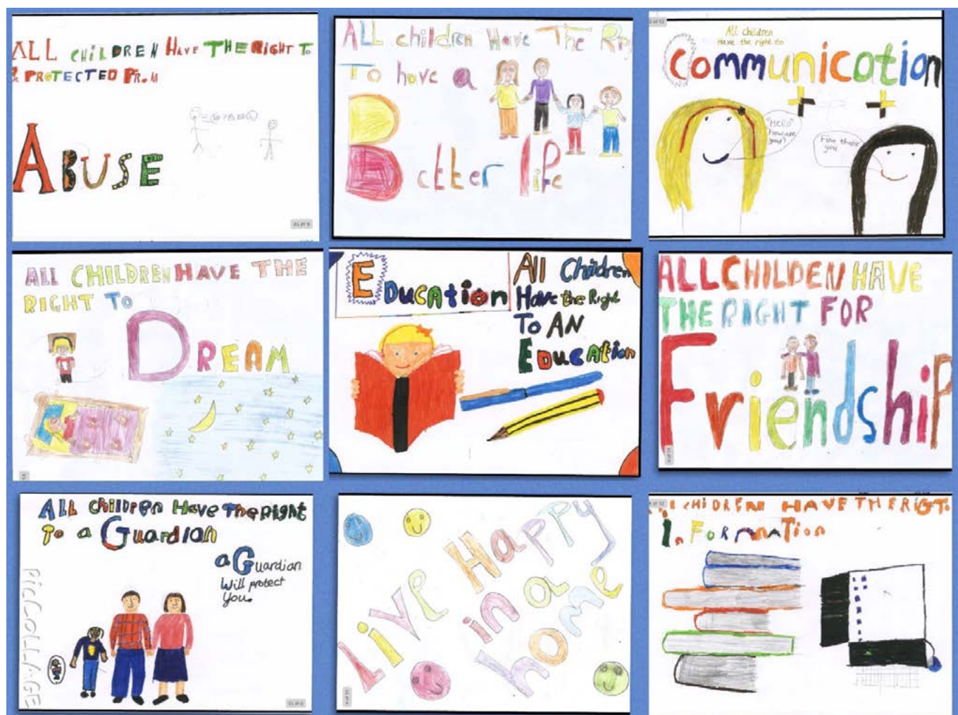
Artwork from pupils at Frances Olive Anderson Primary School and Mohammad Shamel School, Beirut, Lebanon

Ask your pupils to find out who is their Member of Parliament and Member of the European Parliament. Perhaps they could contact them to find out what their opinions are on the issue of migrants and refugees? If your pupils disagree with their opinions, or feel strongly about this issue, they could write to them expressing their views.