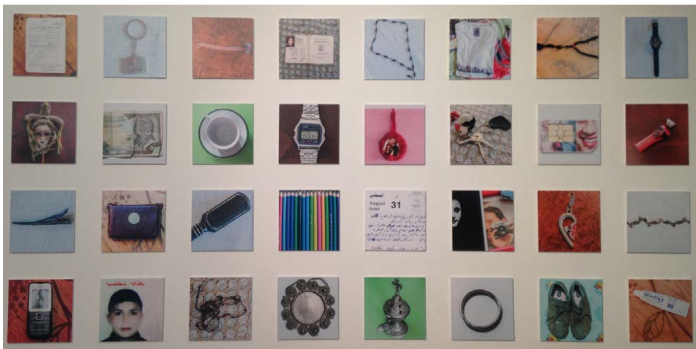
Photographs of precious objects brought from Syria, from the Syria: Third Space Exhibition

Bring in an object that is precious to you concealed in a bag or box. Tell your pupils that they have ten questions to try and work out what the object is and why it is precious to you. You can only reply yes or no to their questions. Reveal your precious object to the class and explain its significance to you.